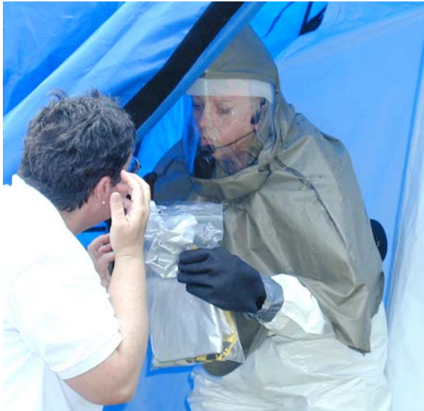
Put victim's personal items in a labeled plastic zip bag.