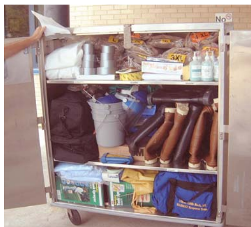
Staff can quickly move wheeled equipment carts from storage to the staging area.

Long-term maintenance of battery-powered respirators, such as PAPRs, creates a special challenge. The