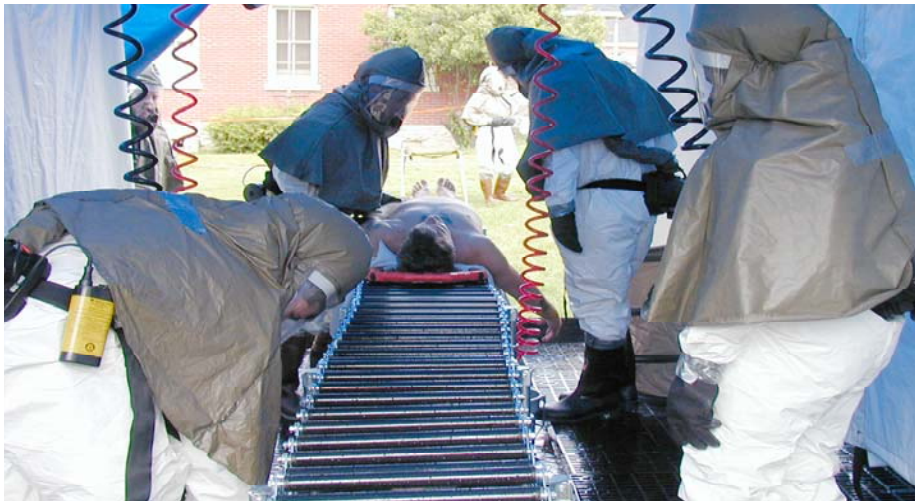
A roller system platform helps move non-ambulatory victims on backboards through the decontamination facility.

Because of the time it takes first receivers to put on PPE and to set up decontamination facilities, hospitals may want to consider arranging for alternate rapid forms of decontamination until more sophisticated decontamination facilities are up and running. For example, some hospitals use high capacity, low-pressure hoses or showerheads, connected to high capacity, temperature-controlled water sources. These hoses and showers allow rapid preliminary drenching of multiple victims. Where multiple shower heads can be activated, ensure that the available water flow into, and through, the system is adequate to provide rapid decontamination at each shower head. 68