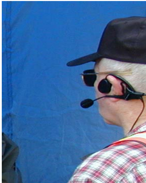
Detail of “temple-transducer” style radio headset.