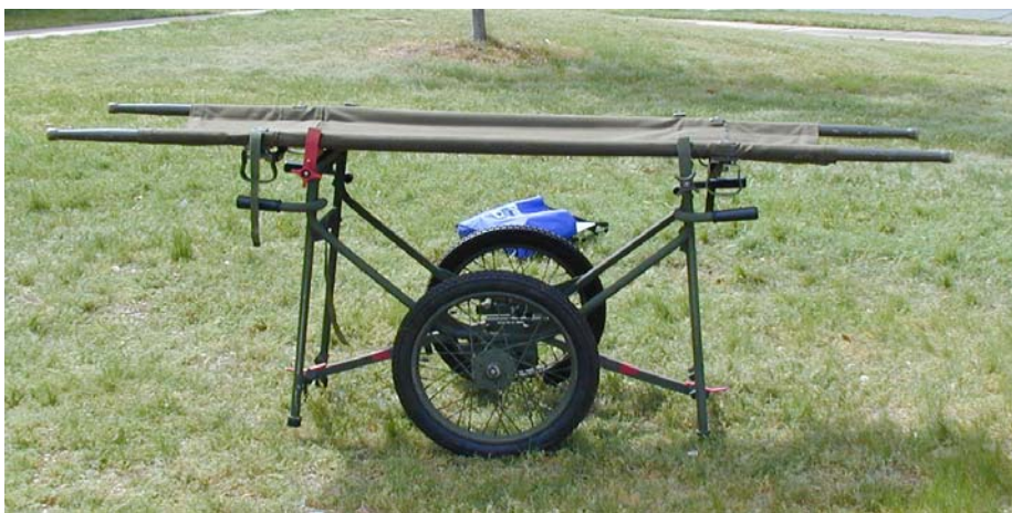
Hospitals can obtain military surplus equipment to supplement the decontamination facility supplies. (Shown here: a field stretcher for transferring non-ambulatory victims from arriving vehicles to the decontamination facility.)