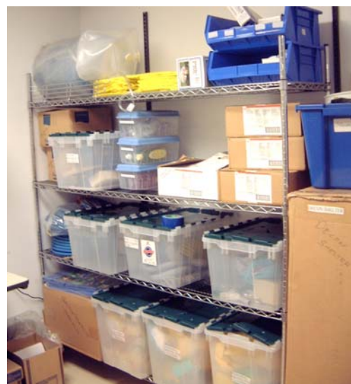
A storage room near the ED door offers convenient access for first receivers' supplies.