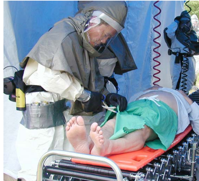
Use blunt scissors to cut away clothing. Avoid stretching or wringing cloth.

Non-ambulatory victims can require a substantial proportion of first receivers time and efforts. First receivers are likely to experience the greatest exposures while assisting these victims. Staff should take steps to identify possible sources of contamination and limit their exposure to those sources. For example, Hospital A uses specific procedures for removing victims clothing to minimize first receiver and victim exposures. Assistants use blunt-nose scissors to cut away clothing, rather than pulling it off. Tugging on clothing can produce a wringing action that might distribute contaminant on the victim, healthcare workers, and the surrounding area. Once removed, the clothing is immediately placed into a sealed container.