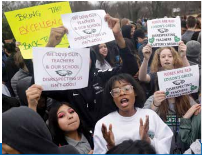
Students at Edison Preparatory School protest a lack of funding for teachers in Tulsa, Oklahoma.

Education for citizenship is the first, essential part of securing the future of American democracy. (For more on the importance of civics education in preserving our republic, see the article on page 14.) This is not because—as some have incorrectly suggested—popular support for democracy is flagging or because today’s youth are less committed to democratic governance than previous generations. In fact, the best evidence indicates that support for democracy has increased modestly and American youth