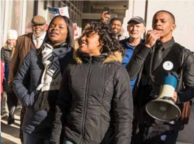
Chicago students march to the U.S. Department of Education to deliver report cards to Secretary DeVos.

for them to know that there are 435 members of the House of Representatives. This concept of bottom-up civic engagement is what the book America, the Owner's Manual: You Can Fight City Hall—and Win is all about (see the sidebar below).