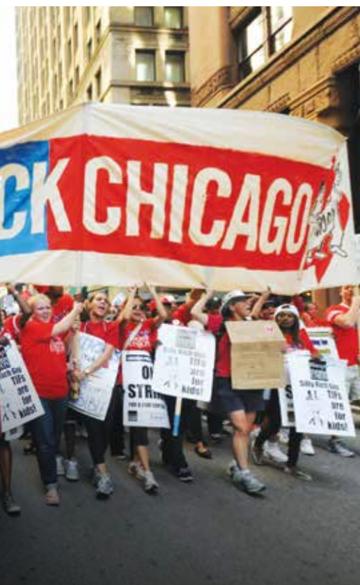
The Chicago Teachers Union on strike in 2012. Inset: Margaret Haley, a leader of the Chicago Teachers Federation.

Democratic politicians not doing nearly enough to arrest it, a trend scholars have referred to as “neoliberalism”—organized teachers, as unfair as it might be to expect it, must do even more. I concluded in the book that “two examples of teacher unionism, one hundred years apart ... show that teacher organization is at its best when it is part of a larger social movement and when it can show how intimately related are teacher working conditions, student learning conditions, and social equality.”