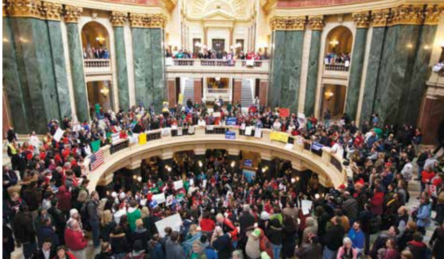
In February 2011, thousands protested inside the state capitol in Madison against Governor Scott Walker's Act 10, which hobbled public employee unions in Wisconsin.