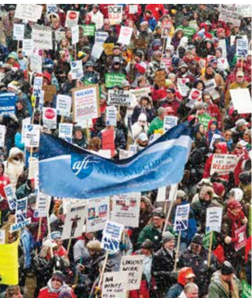
More than 70,000 public employee union members and protesters took part in a February 2011 rally in Madison.