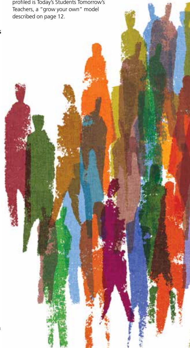
JING JING TSONG, THEISPOT.COM