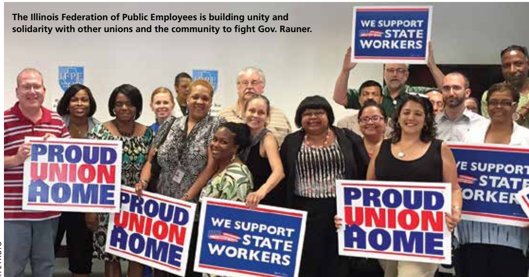
The Illinois Federation of Public Employees is building unity and solidarity with other unions and the community to fight Gov. Rauner.

allows either party involved in labor negotiations to declare an impasse and bring in a third-party arbitrator to help them reach a binding deal as a way to avoid a strike or lockout. Although the legislation passed, the governor vetoed it. At presstime, the coalition was working with legislators to override the veto.