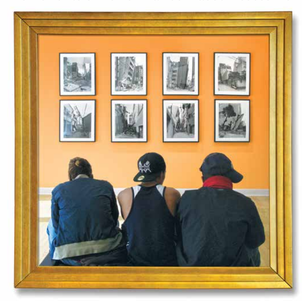
Left, students at New York City's Urban Academy Laboratory High School observe art during a gallery visit.

The Benefits of Performance-Based Assessment