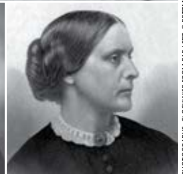
PHOTOGRAPHS, CLOCKWISE FROM FAR LEFT: © BETTMANN/CORBIS; COURTESY OF IBI LIBRARY; ENGRAVED BY G. E. PERINE & CO., NY; BY ADDISON N. SCURLOCK