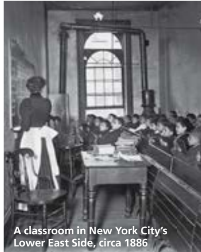
A classroom in New York City's Lower East Side, circa 1886

England or South Korea. Young adults were suffering from a 17.1 percent unemployment rate, compared with less than 8 percent in Germany and Switzerland. More than half of recent college graduates were jobless or underemployed for their level of education. 7 A threadbare social safety net, run-amok bankers, lackadaisical regulators, the globalization of manufacturing, and a culture of consumerism, credit card debt, and short-term thinking might have gotten us into this economic mess. But we’d be damned if better teachers couldn’t help to get us out. “Great teachers are performing miracles every single day,” Secretary of Education Arne Duncan said in 2009. “An effective teacher? They walk on water.” 8 The rhetoric could provoke whiplash. Even as we were