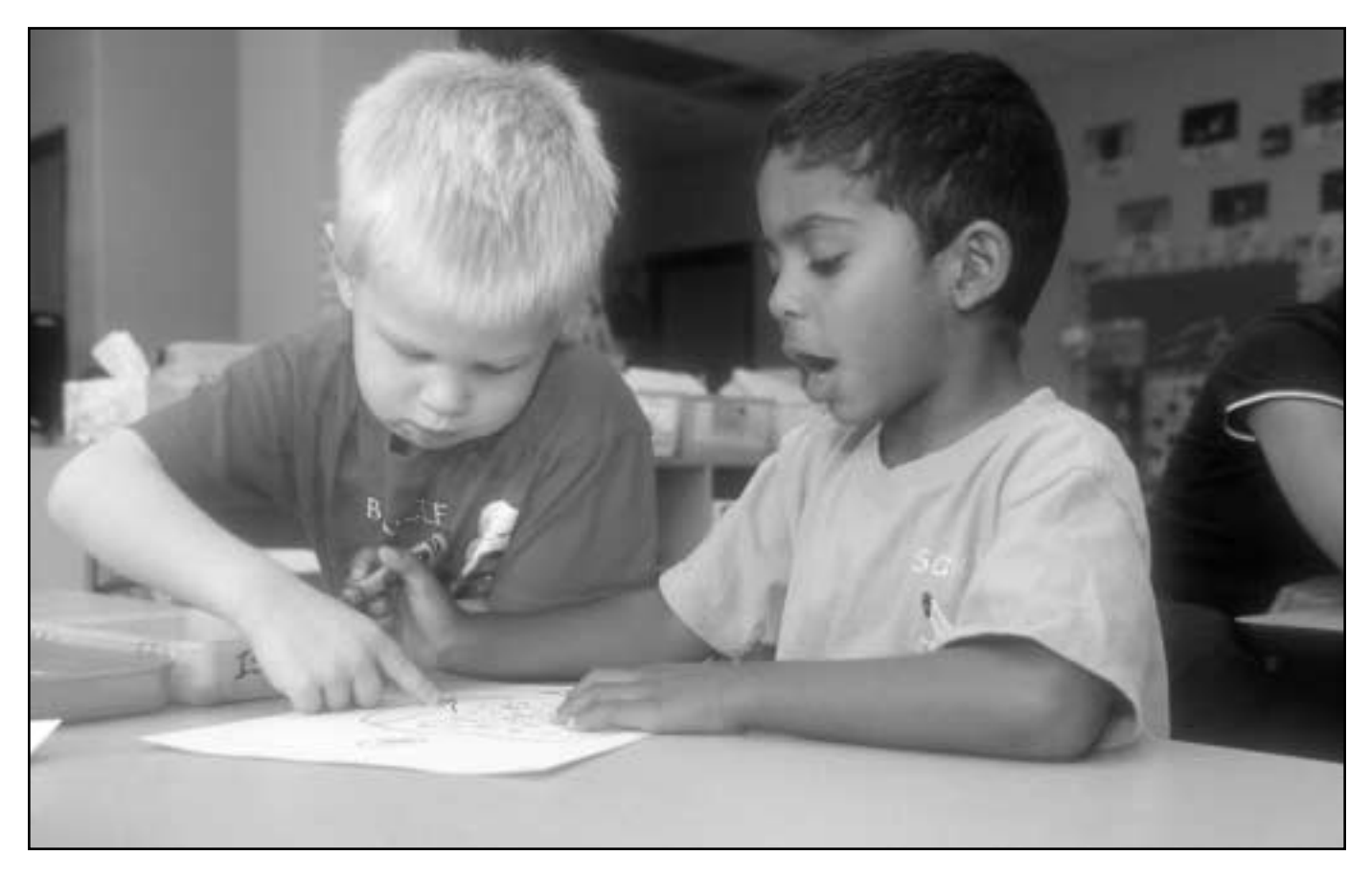
AT THE STARTING LINE

After compiling and organizing these data, we applied the criteria and indicators introduced above to examine the extent to which state programs met basic levels of access and quality. Once we completed the analysis, we sent a draft to the state agency responsible for administering the program(s). We asked state administrators to review the accuracy of our data and made revisions as appropriate.