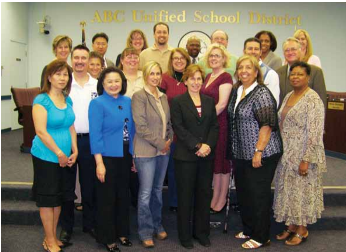
Randi Weingarten, the president of the American Federation of Teachers, with members of the ABCUSD cabinet.

A charter statement or agreement is one option available to district and union officials. But drafting contract language that describes the partnership and includes those principles is also an option. This might send an even stronger message to successors that they should protect the partnership and follow the principles.